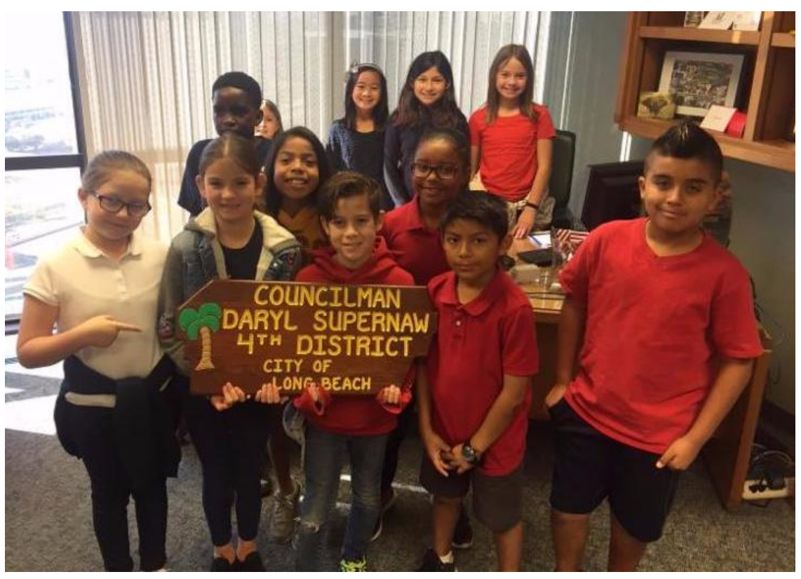
Prisk Elementary School's Student Council

17 different LBUSD elementary and middle schools visited City Hall this past week. We had four Fourth District schools, Herrera, Minnie Gant, Prisk and Willard, visit us on Monday and Wednesday. We gave them a tour of City Hall, the Councilmembers' offices and the Mayor's office. Thank you to the students, staff and parents who visited City Hall this week.