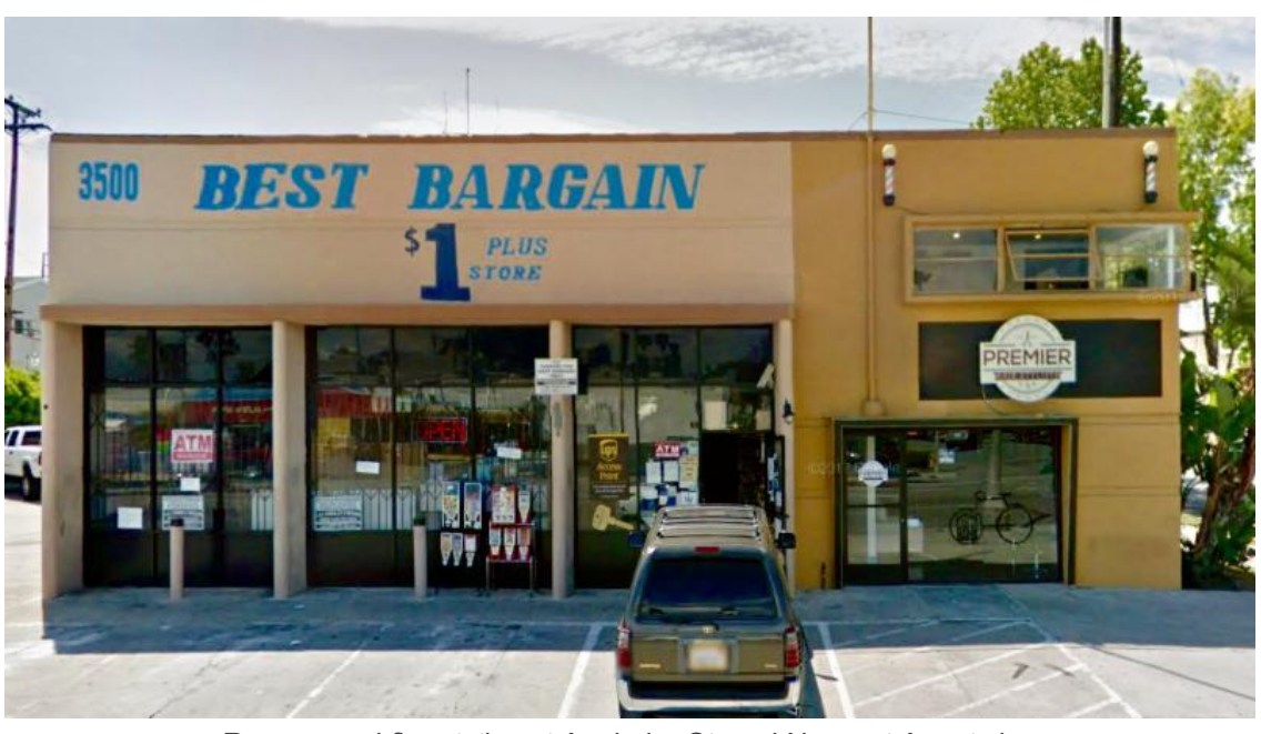
Repurposed fire station at Anaheim St. and Newport Ave. today