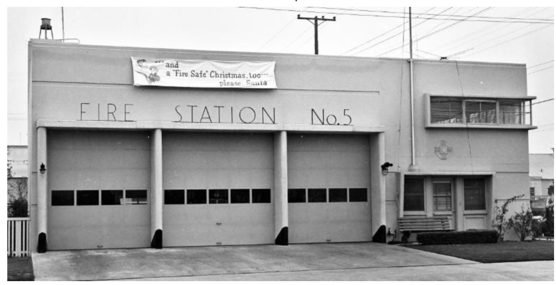
Fire Station No. 5 at Anaheim St. and Newport Ave. circa 1947

The "12 Days of Fire Safety" campaign posted in today's newsletter is part of a long tradition at the LBFD. The vintage photo below shows a former 4th District fire station 70 years ago at 3500 E. Anaheim St. The banner reads, "and a 'Fire Safe' Christmas, too... please Santa". Station 5 was moved to El Dorado Park in the 1960's, but the building still remains at the S/E corner of Anaheim and Newport.